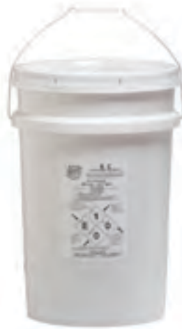
Standard (BC) Pt. # 61400