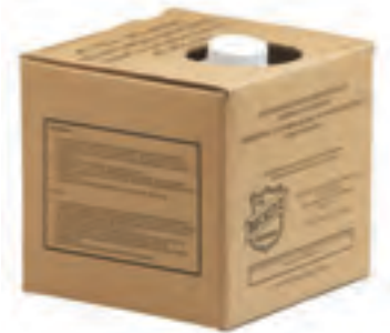
6 Liter Container Pt. # 600872