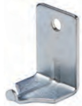
Pt. # 700204