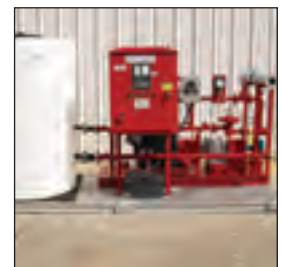
Diesel Pump Skids