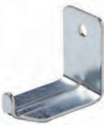
Pt. # 700249