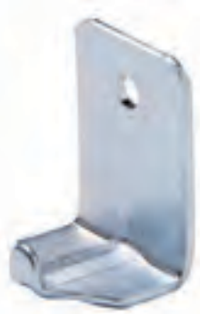
Pt. # 700203