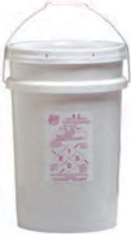
Purple K Pt. # 61200