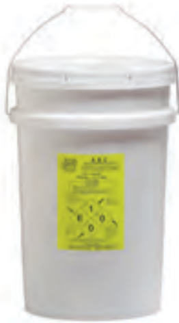
ABC Pt. # 61000