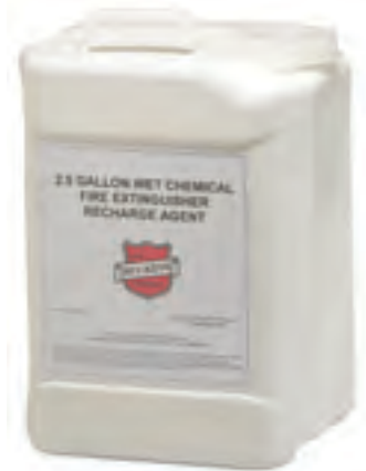
2.5 Gallon Container Pt. # 600871