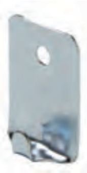
Pt. # 700202