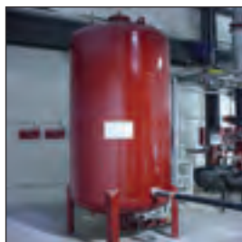
Foam Bladder Tanks