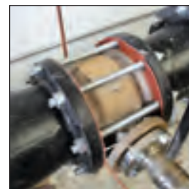
Foam Concentrate Proportioners