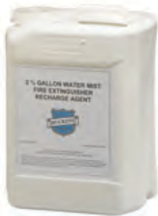
2.5 Gallon Container Pt. # 600910