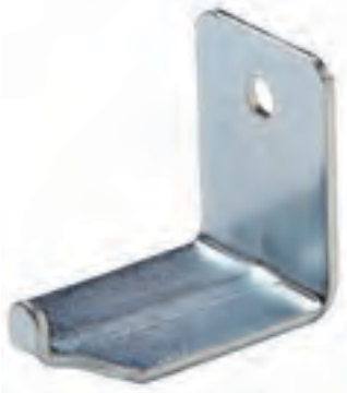
Pt. # 700247