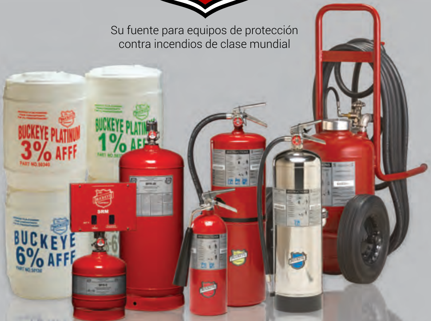
Foam Concentrates & Hardware

Su fuente para equipos de protección contra incendios de clase mundial